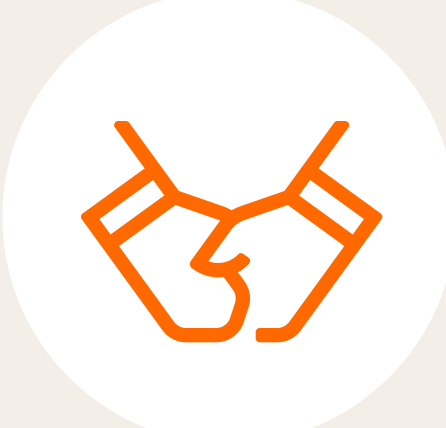
We treat each other equally